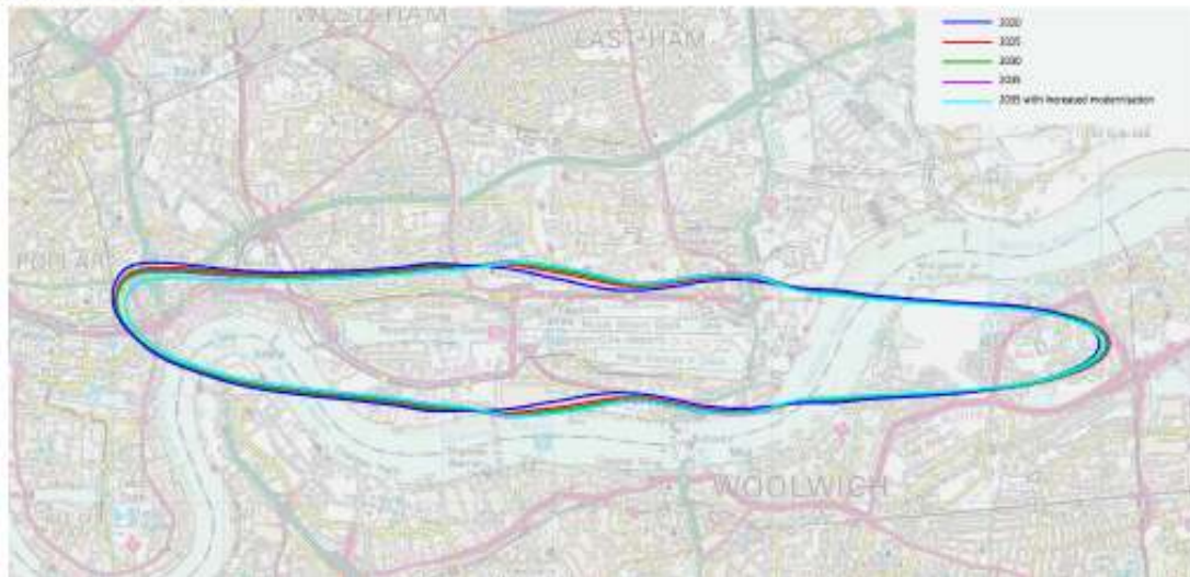
Figure 9.2: Contours of 57 dB Leq noise contours

However, all is not as it might seem. This noise contour only goes as far as Blackwall in the west and into part of Thamesmead in the east. It is what is known as the 57 decibel contour. It tells us nothing about what would happen in the borough from which London City gets most complaints, Waltham Forest. It says nothing about the impact on South London where planes are forced to fly for miles at a maximum of 2,000ft to stay under the Heathrow aircraft.